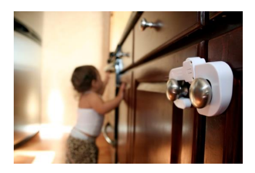
What is the Gear-Up Safety Program?

Through the Gear-up Safety program families will be provided with the necessary safety items (pack-n-play, car seats, outlet cover, baby locks, baby gates, carbon monoxide/smoke detectors, ect.) to ensure that their home is a safe place for their children. In addition, staff will help with the installation of the safety materials and provide education/training on the safety topics identified by the family.